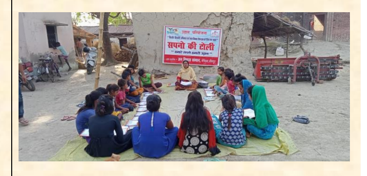
CBO Meeting – Sapno Ki Toli