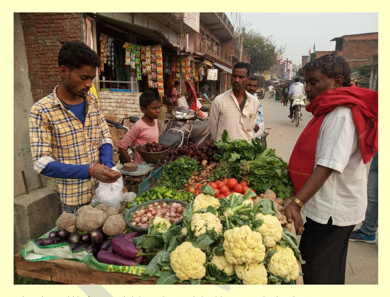
When the world before you shrinks, JVS expands it with a supportive hand...